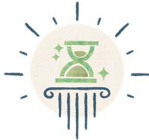
EXPLICIT INSTRUCTION, INTERVENTIONS, & EXTENSIONS