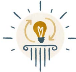
ONGOING PROFESSIONAL GROWTH